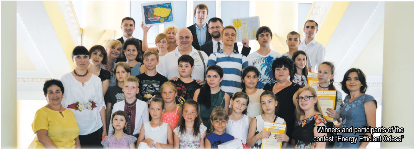
Winners and participants of the contest "Energy Efficient Odesa"